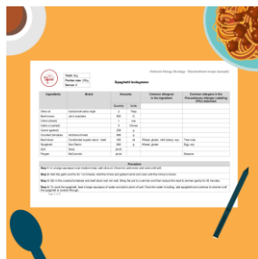
Standardised Recipe Template