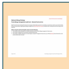
Allergen Management Audit Tool